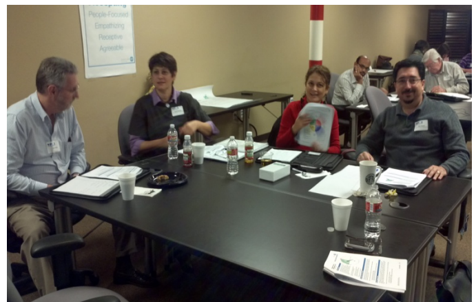
Above: Members of the PMI Houston board of directors and directors of various committees working on DiSC