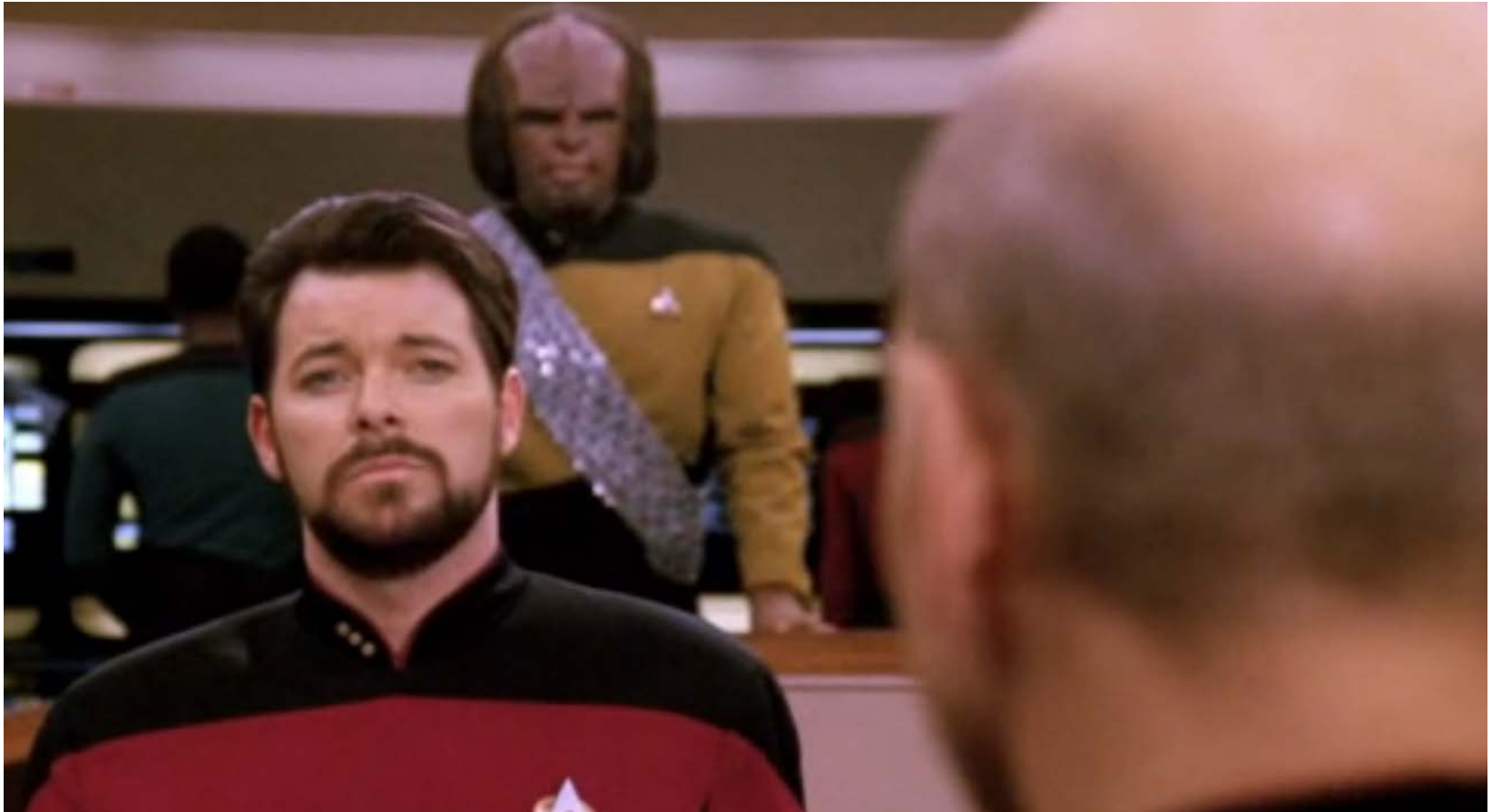
"Allegiance." Star Trek: TNG . CBS. 26 Mar. 1990. Television.